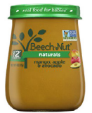
Mango Apple Avocado