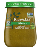
Spinach Zucchini Peas