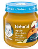
Apple Zucchini Peach