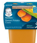
Sweet Potato Corn