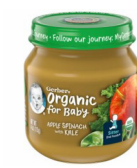
Apple Spinach Kale