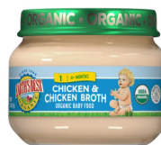
Chicken & Chicken Broth

For exclusively breastfeeding participants only Earth's Best Organic brand; 2.5-ounce glass jars only; Only the specific types as listed below: