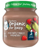
Pear Purple Carrot Raspberry