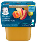
Apricot Mixed Fruit