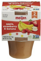
Apple Strawberry Banana

Meijer brand foods only; 2-4-ounce plastic twin-pack; Only the specific types as listed: