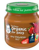
Apple Strawberry Beet