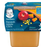
Squash Apple Corn