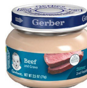
Beef & Gravy

For exclusively breastfeeding participants only; Gerber brand second foods only; 2.5-ounce glass jars only; Only the specific types as listed below: