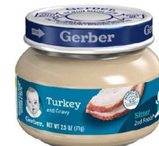
Turkey & Gravy