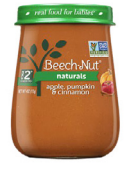
Apple Pumpkin Cinnamon