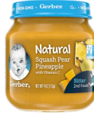
Squash Pear Pineapple