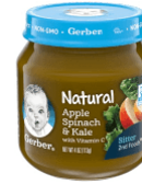
Apple Spinach Kale