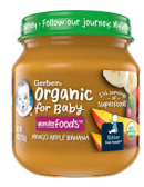
Mango Apple Banana