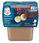
Banana Plum Grape