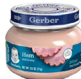
Ham & Gravy