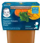
Sweet Potato Mango Kale