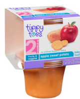
Apple Sweet Potato