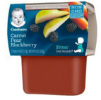
Carrot Pear Blackberry