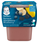
Banana Blackberry Blueberry