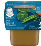
Pea Carrot Spinach