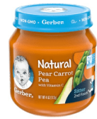
Pear Carrot Pea