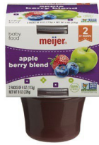
Apple Berry Blend