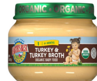
Turkey & Turkey Broth