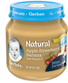
Apple Strawberry Banana