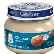
Chicken & Gravy