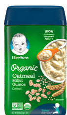
Oatmeal Millet Quinoa