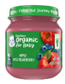
Apple Wild Blueberry

Gerber® 2nd Foods® Organic; 4-ounce glass containers only. Only the specific types as listed below: