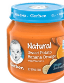
Sweet Potato Banana Orange