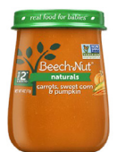
Carrots Sweet Corn Pumpkin