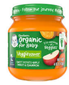
Sweet Potato Apple Carrot Cinnamon