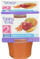
Apple Carrot Mango