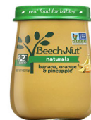
Banana Orange Pineapple