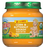
Corn Butternut Squash